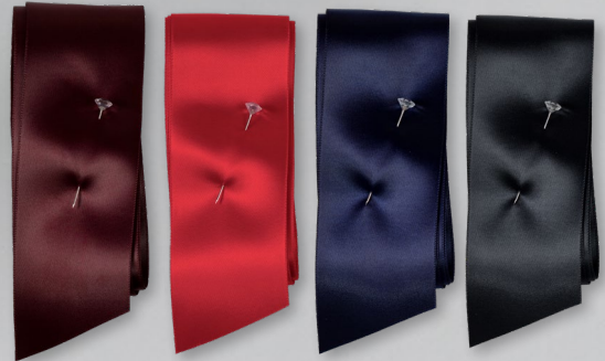
277 BURGUNDY 250 RED 370 NAVY 030 BLACK