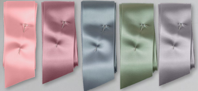
113 CHATEAU ROSE 125 FROSTED BERRY 2331 DUSTY BLUE 576 DARK SHALE 021 WHISPER